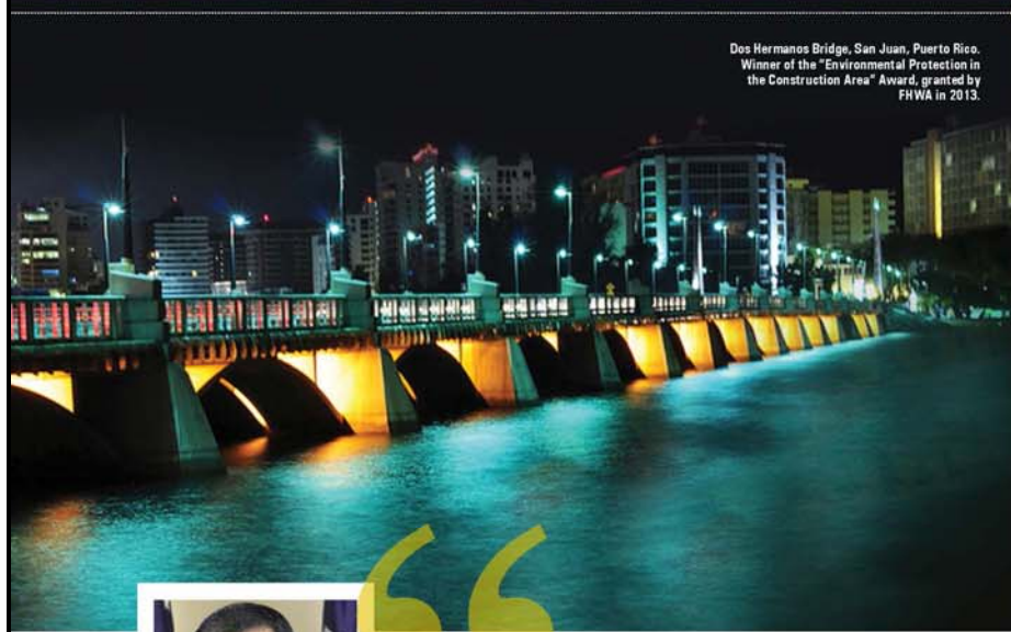
Dos Hermanos Bridge, San Juan, Puerto Rico. Winner of the "Environmental Protection in the Construction Area" Award, granted by FHWA in 2013.